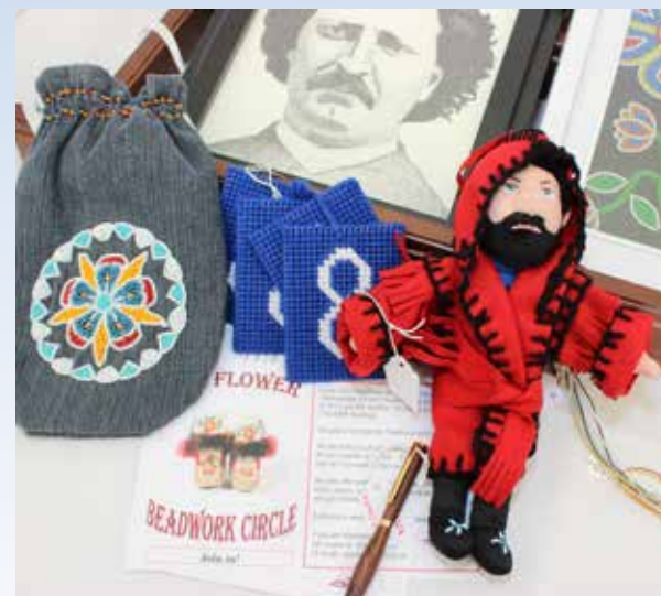
The Flower Beadwork Circle craft table at the MMF 2016 AGA.

LRI has a variety of local beaders of all ages attending their weekly Flower Beadwork Circle. The group welcomes all new members, novices, experts, and any skill level in between, and encourages anyone interested in learning the craft to attend a session. Those who have experience with the craft are encouraged to bring in pieces of their own. First-time attendees are given two beginner projects to learn basic Métis beading techniques. The first project is a traditional, beaded flower design on a square of fabric, and the second is a medicine bag which the