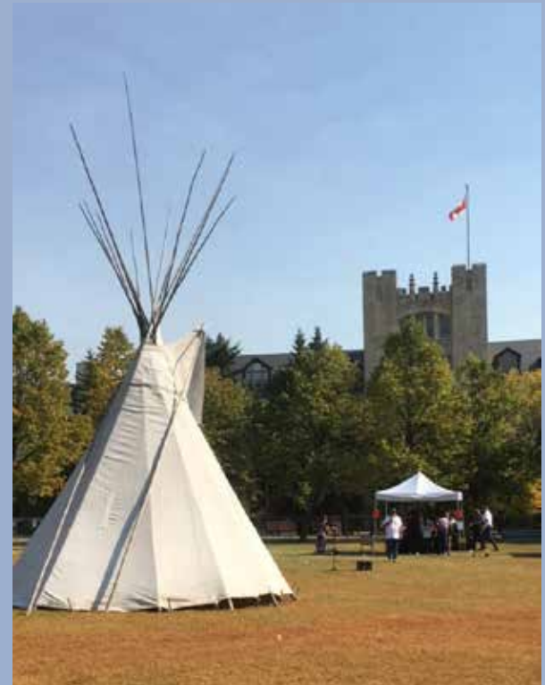
University of Manitoba hosts annual Indigenous Orientation allowing indigenous and non-indigenous students to celebrate indigenous culture.

"Growing up I always listened to fiddle music on NCI