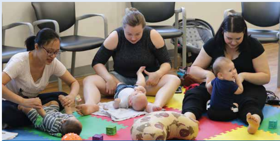
Mothers at the Little Moccasins program form relationships with other parents and gain insight and information about their baby's development at the Access Saint-Boniface location in Winnipeg.

The Manitoba Metis Federation's Little Moccasins program celebrated its one-year anniversary last month at their Access Saint-Boniface location in Winnipeg. The program helps new parents, and parents-to-be, to connect with each other and learn more about their baby's health and development.