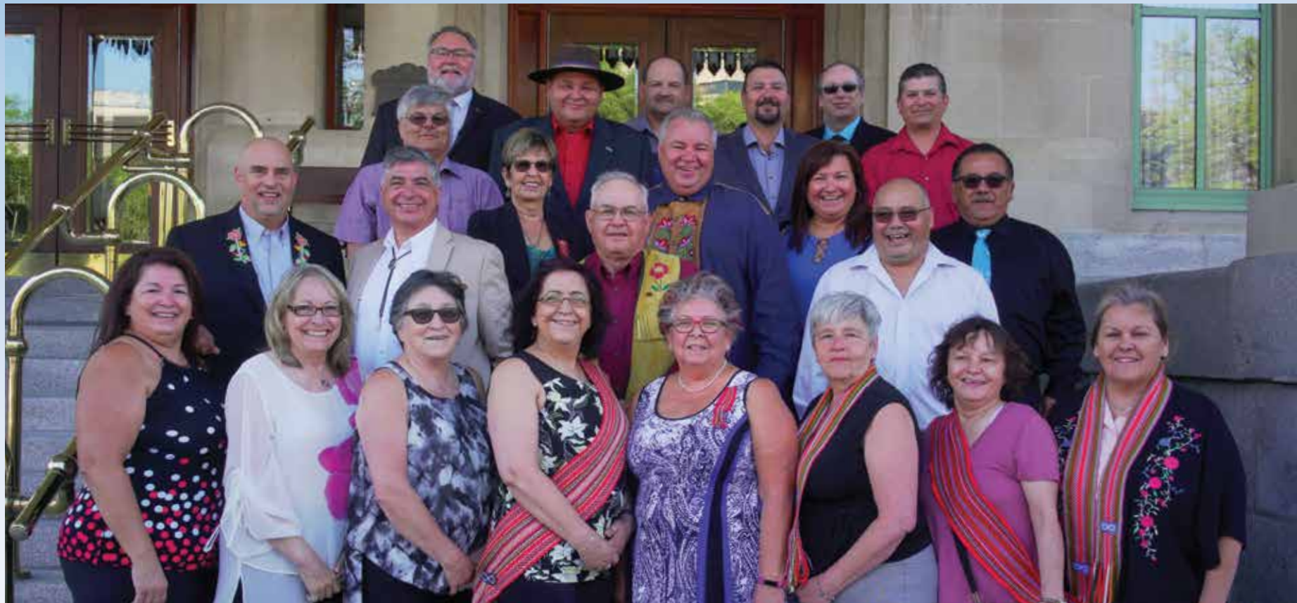
The elected MMF representatives pose for a photo following the new cabinet appointments on June 15 at the Fort Garry Hotel in Winnipeg.