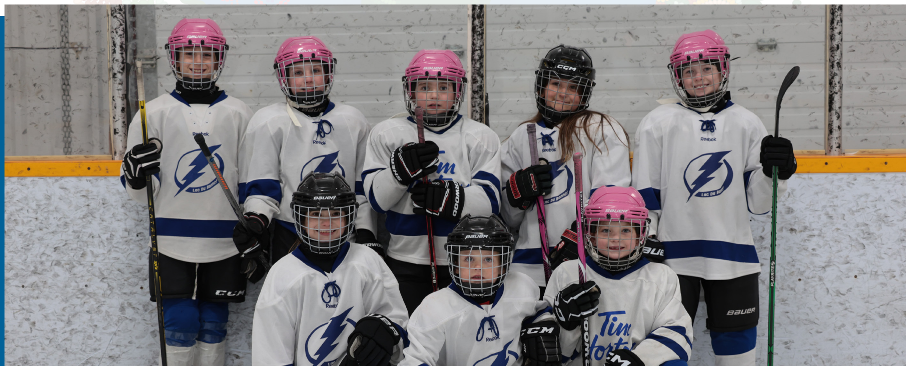
2023 has been the first time Lac du Bonnet has been able to field an U9 all-girls team.

After the Lac du Bonnet Arena submitted a proposal, the MMF provided a cheque for $27,000 to help fill the gaps and make the change room a reality. Construction is currently underway, with many volunteers from the team and community coming together to donate their time and efforts to the project.