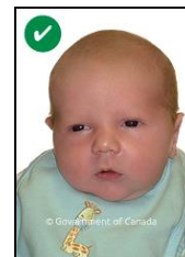
Correct child pose