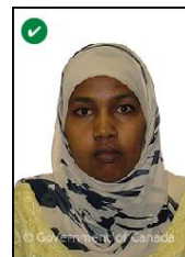
Facial Features are visible