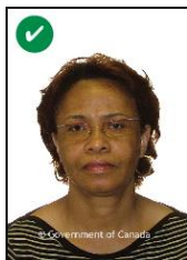
No glare on glasses