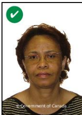
No glare on glasses