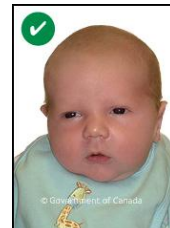
Correct child pose