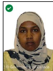
Facial Features are visible