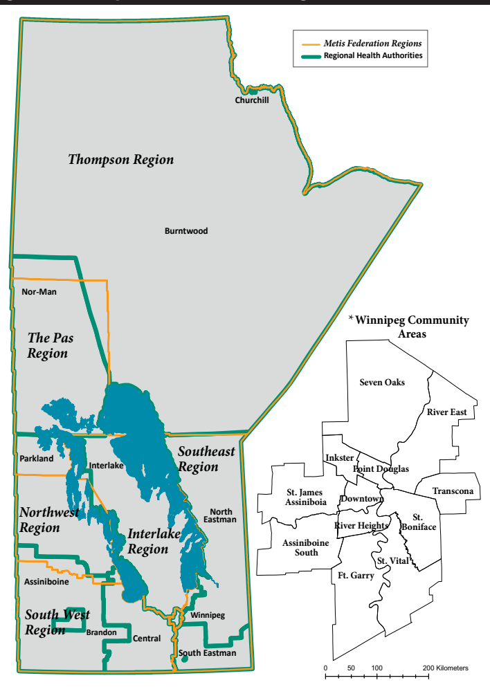
*The MMF Region and provincial RHA for Winnipeg are the same.

This 16-chapter report examines more than 80 health indicators, from physical illnesses to the use of hospital services to the quality of primary care, and even to educational success and the use of social services. There are some good findings — and some that are troubling.