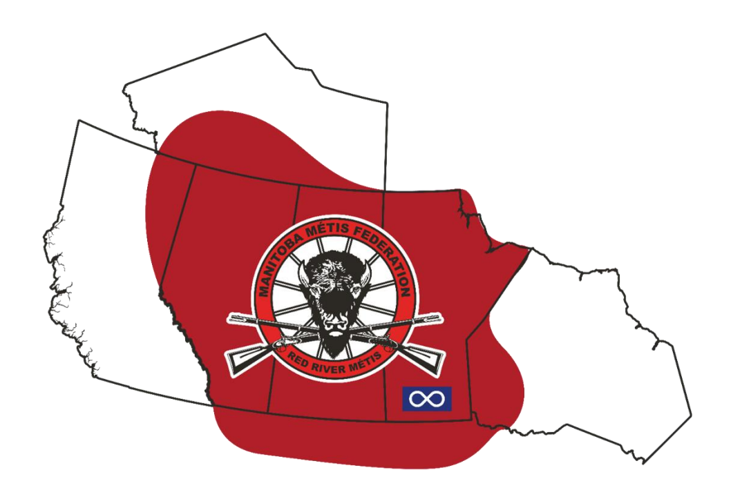
Figure 1.2.1 Artistic Rendering of the Red River Métis Homeland