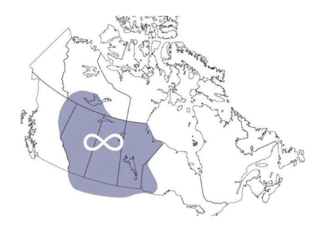
Figure 1.2.1. Homeland of the Métis Nation

To this day, Red River Métis remain overrepresented in the foster care system and among the unemployed, the incarcerated, and the chronically ill.