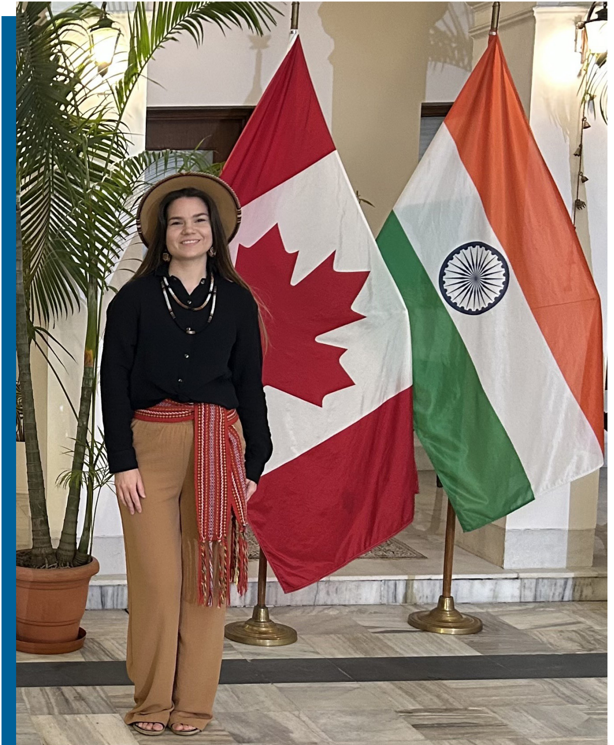
The Citizen was honoured to represent the Red River Métis in New Delhi, India.