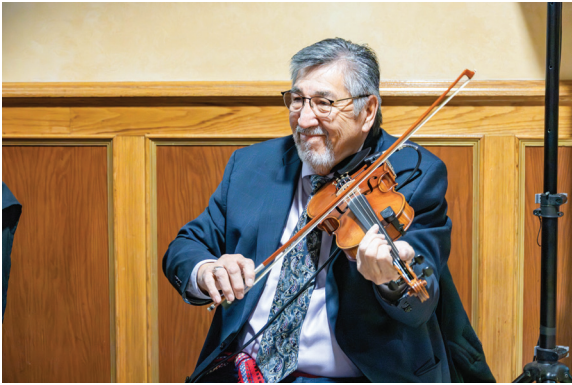
The 2025 Red River Métis Business Excellence Gala award recipients were recognized in their respective categories for their remarkable talent, determination, and dedication to community.