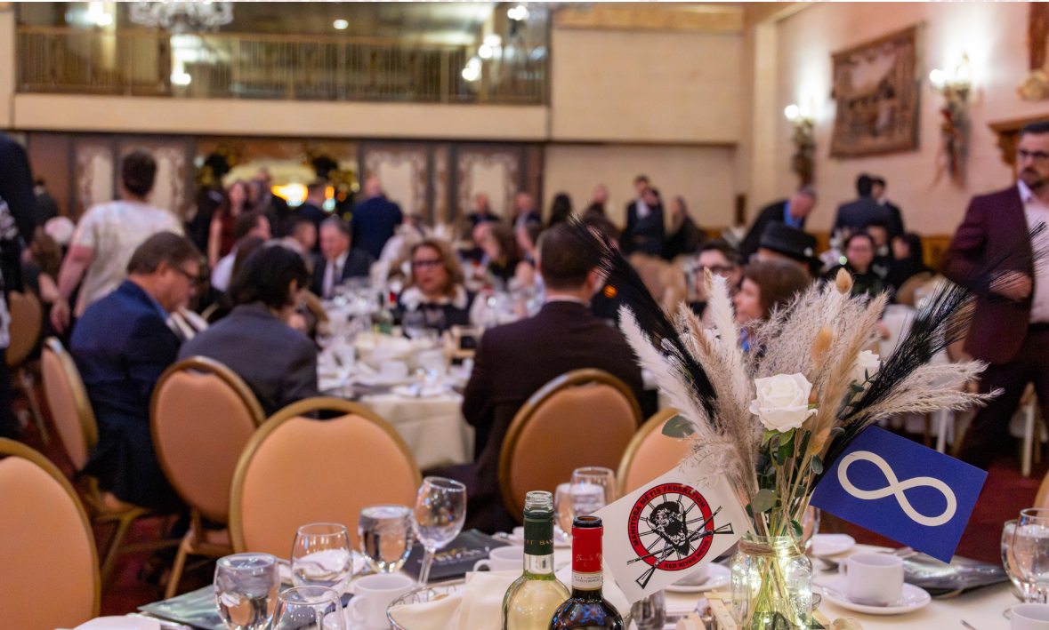
Held at the Fort Garry Hotel, the gala was swimming with nearly 450 attendees sharing warm embraces, friendly smiles, and networking in their exceptional Red River Métis fashion.

“Winning this award is just, honestly, an honour and a privilege... There are incredible candidates