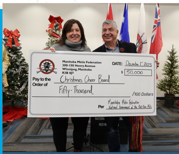
The MMF takes great pride in giving back to the Red River Métis Community and beyond – the spirit of generosity shone bright with a $50,000 donation to the Christmas Cheer Board, supporting a cause that helps families in need during the holiday season.

Throughout the year, the MMF gave back to Red River Métis Citizens and the general public through our continued humanitarian efforts. Your Government is proud to support and build connections in the community.