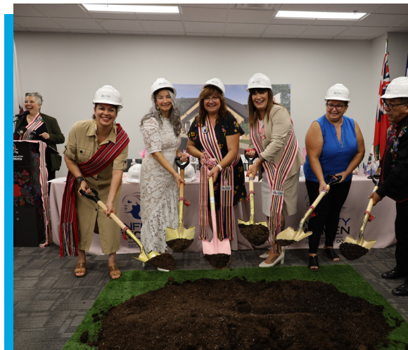
On August 28, proud MMF affiliate Infinity Women Secretariat invested in the creation of transitional housing units for Red River Métis women and children in the Interlake Region. The project was done in partnership with both the province of Manitoba and the Canadian government.

2025 was a year of remarkable progress for IWS, highlighted by the opening of its first Little Infinity Child Care Centre and transitional housing in the Interlake Region.