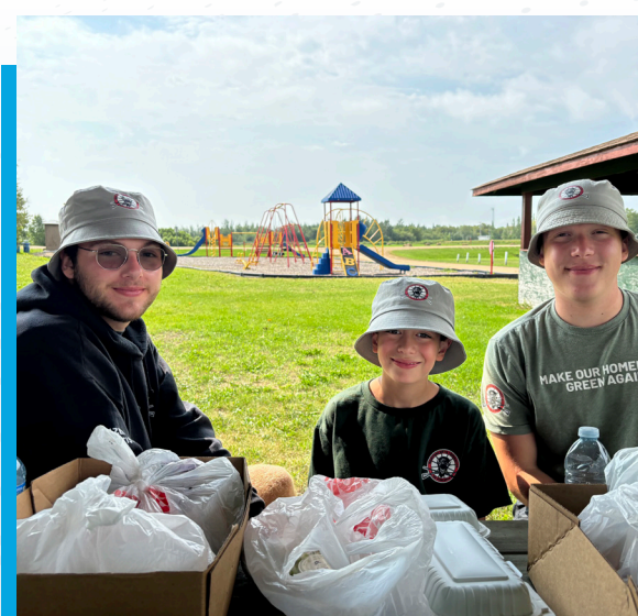
EIRM offers programs to Citizens of all ages to provide land-based knowledge rooted in Red River Métis tradition.

The MMF's Energy, Infrastructure, and Resource Management (EIRM) Department kept busy in 2025. From the Federal Grizzly Bear and Wolverine Management Plan consultations in February to the Winter Preparedness Webinar offered in late fall, EIRM actively participated in the community, making sure Red River Métis traditional values of conservation and sustainability were reflected across the Homeland.