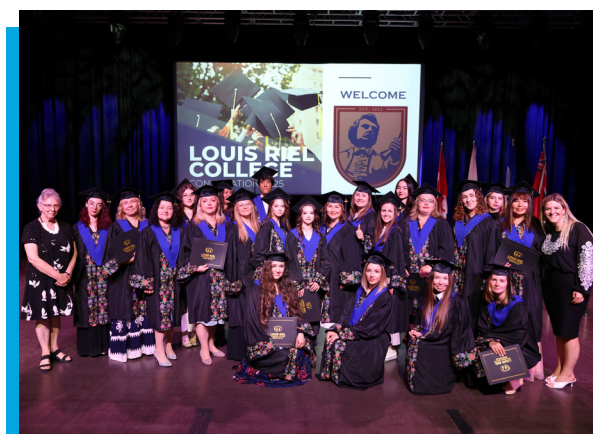
In 2025 the Lous Riel College (LRC) celebrated its largest graduating class yet with approximately 300 students graduating from different faculties.

Advanced Training and Education portfolio, providing programming relevant to Red River Métis Citizens such as healthcare and education. The new name reflects LRC's vision for the future and their dedication to quality and culturally rooted education.