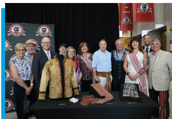
In 2025, the MMF, National Government of the Red River Métis, welcomed home the "Our Grandmothers" Collection, a collection of historical artifacts. The transfer of ownership is a beautiful representation of the historical identity and sovereignty of the Red River Métis.

At the heart of the MMF's mission is the celebration and protection of Red River Métis identity, which includes actively confronting Indigenous identity fraud.