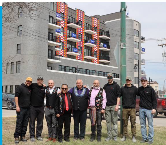
The MMF's mixed-use residential complex in Selkirk had its grand opening on April 30. The project houses 49 Red River Métis Elders and seniors.

On April 30, the National Government of the Red River Métis held a grand opening a mixed-use residential complex in Selkirk, Manitoba. The 77,900 square foot building provides housing for 49 Red River Métis Elders and seniors, representing an important step in the MMF's ongoing efforts to bridge the housing gap.