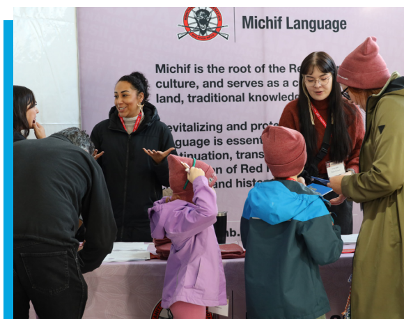
You can find the Michif Language Department engaging with Citizens at their booth during any major MMF event.

The Michif language is a core expression of Red River Métis culture and identity. In 2025, the MMF's Michif Language Department worked diligently to ensure the continuation and revitalization of the Michif language across the Homeland.