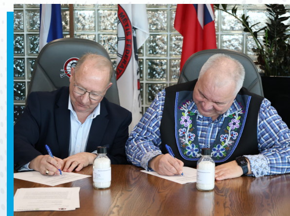
On February 28, the MMF signed an unprecedented royalty agreement with PADCOM – demonstrating their industry leadership and respect for the MMF and the Red River Métis, including our right to self-determination and self-government.

2025 was an exciting year of economic growth across the Homeland, with newly announced national agreements, expanding property investments, and the ongoing development of our Red River Métis Business Directory.