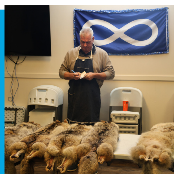
The Red River Métis Fur Company supports Red River Métis Harvesters by going on fur runs throughout the homeland, purchasing Red River Métis-harvested furs above market value.

Ensuring the protection of Red River Métis harvesting rights, the MMF played a leading role in championing for the conservation of traditional Red River Métis land, carrying on long-held traditions.