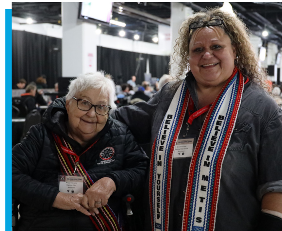
Citizens from near and far came together at the 2025 AGA to participate in democracy and see how the MMF has grown since last year.

will support the company's continued growth and contribute to the development of a second mining venture. The MMF will hold a 10 per cent stake in the second mine, with the project expected to generate millions in revenue.