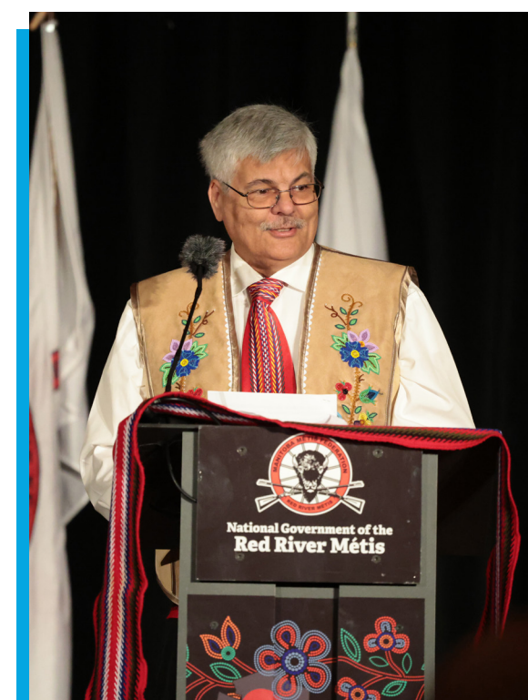
The MMF remembers those we lost this year. May their spirits rest in peace and their legacies live on.