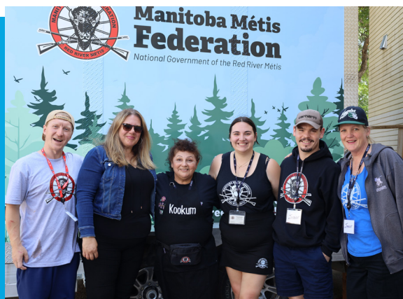
Your Red River Métis Government, MMF staff, and dedicated volunteers spent much of the summer of 2025 supporting wildfire relief efforts!