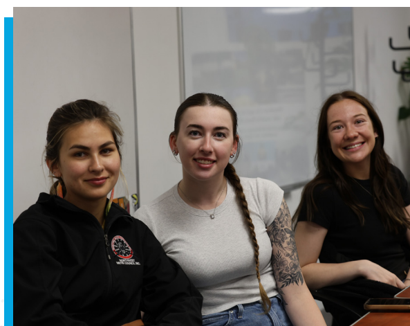
Hosted by the Yellowknives Dene First Nation, Red River Métis, Inuit, and Dene youth came together at the Indigenous Cross-Cultural Camp to learn about each other's cultures through discussions, art, and games.

The MMF continued to provide engaging and culturally enriching opportunities for Youth across the Homeland in 2025.