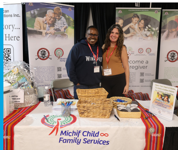
Métis Child and Family Services works hard to ensure Métis children and families are cared for with Red River Métis culture and history in mind.

Throughout 2025, the MMF has responded to and publicly corrected misinformation spread by the Manitoba Government and General Employees' Union regarding provincial funding increases for Michif and Métis agencies on March 7, March 8, and April 3, 2025 – while defending the difficult decisions made to address an unfortunately tight budget for MCFSA due to the lack of federal follow-through of Bill C-92.