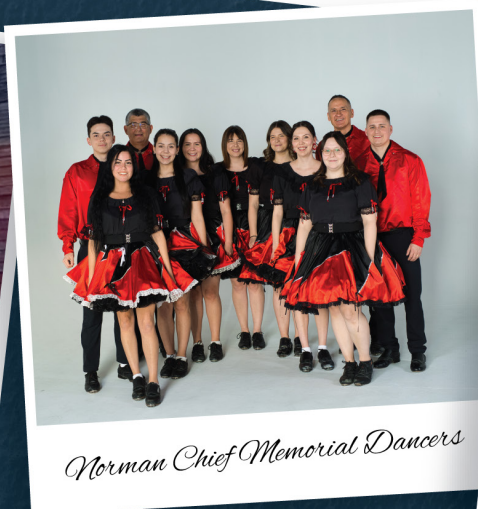
Norman Chief Memorial Dancers