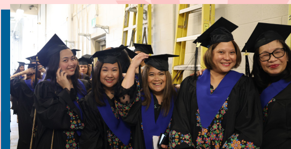
The energy of the graduates was reflective of the well-supported community. Graduates excitedly gathered backstage, collecting in groups to celebrate one another's great accomplishments and hard work.

Any one of us can make waves in our communities through the power of education. LRC will ensure you put your best foot forward to accomplish that goal. If you'd like to learn more about the variety of opportunities at LRC, visit our website at louisriecollege.ca/ .