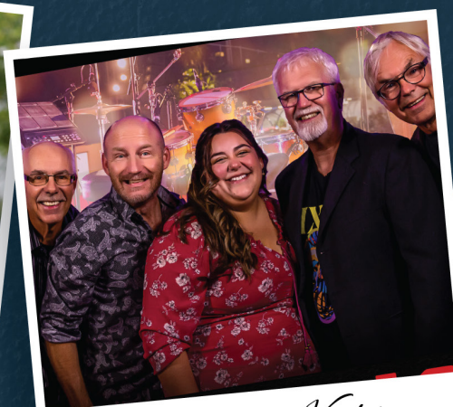
Just for Kicks