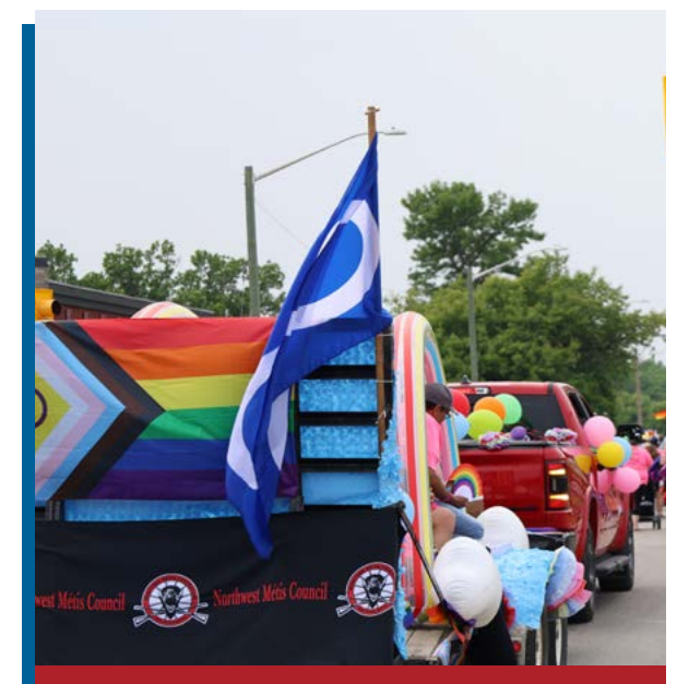
The Northwest Métis Council held its third annual Walk with Pride celebration, attracting an estimated record-breaking 400+ attendees.

Pride hit the streets of Dauphin, Manitoba during the Northwest Region's annual Walk with Pride event; hitting a record-breaking turnout estimated at 400+ attendees.