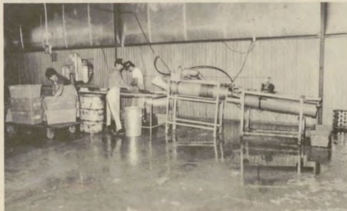
Rough fish is cleaned, filleted and washed in one easy process.