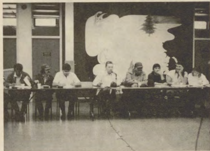
June 2nd and 3rd, 1990. The Pas Regional meeting.