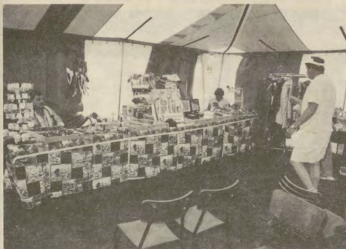
Plenty to see in the Metis pavilion."