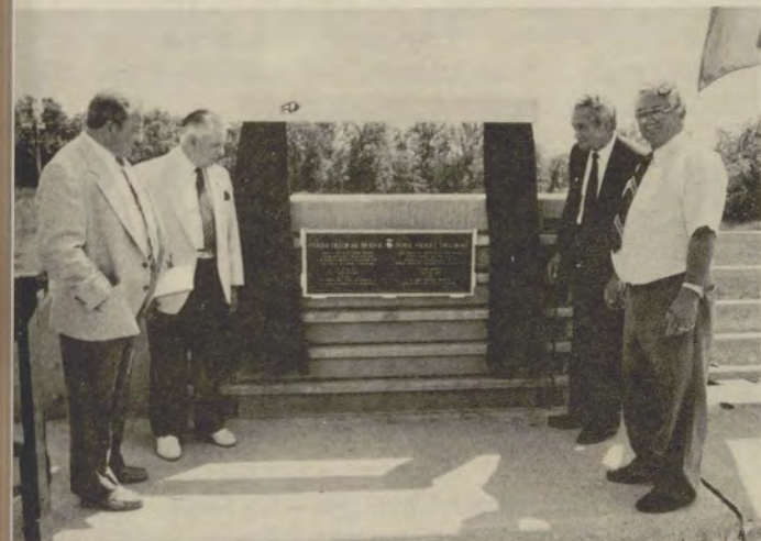
V.I.P.'s were on hand to perform the plaque unveiling.

The bridge crossing the Red River at St. Adolphe has been officially named the Pont Pierre Delorme Bridge.