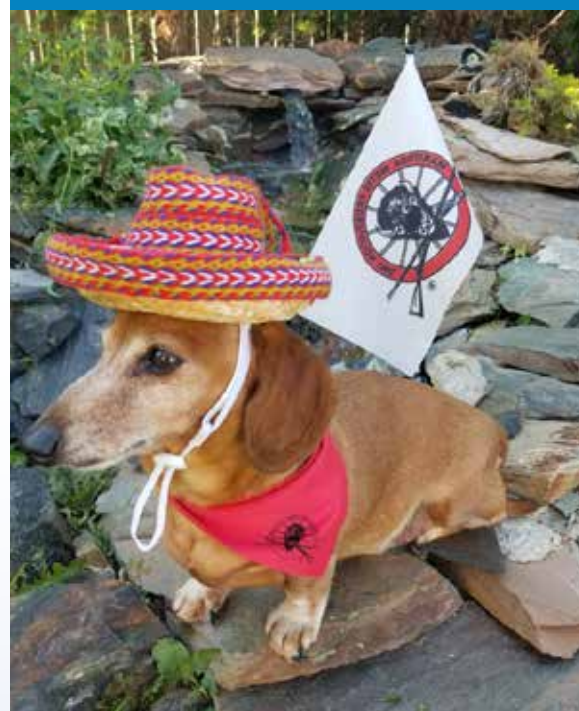
Hot diggity dog! Show your Métis pride.

Le Metis' new Community Photo section invites Métis Citizens to send in photos to be featured in our newsletter. If you have a photo that celebrates the Métis Nation, send it to communications@mmf.mb.ca and you may see it in print!