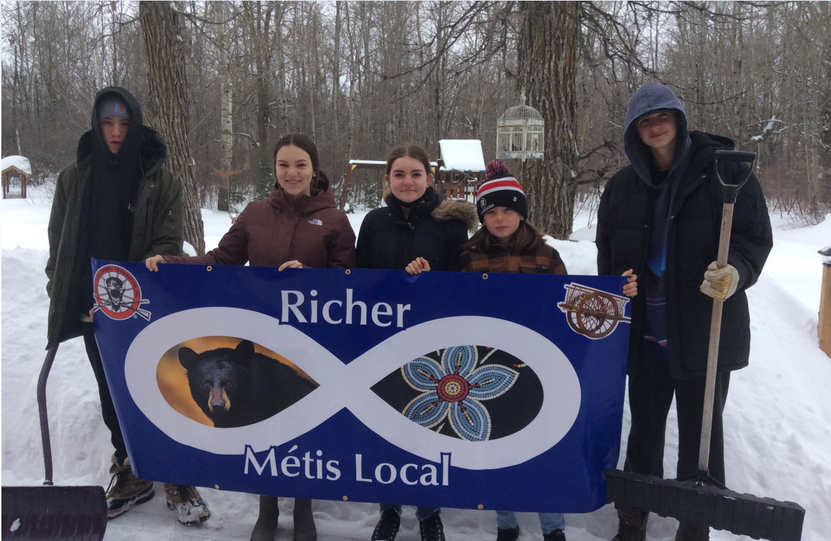
Six Métis Youth in Richer and surrounding areas are working hard to remove snow for over 12 Elders, seniors, and people living with disabilities.