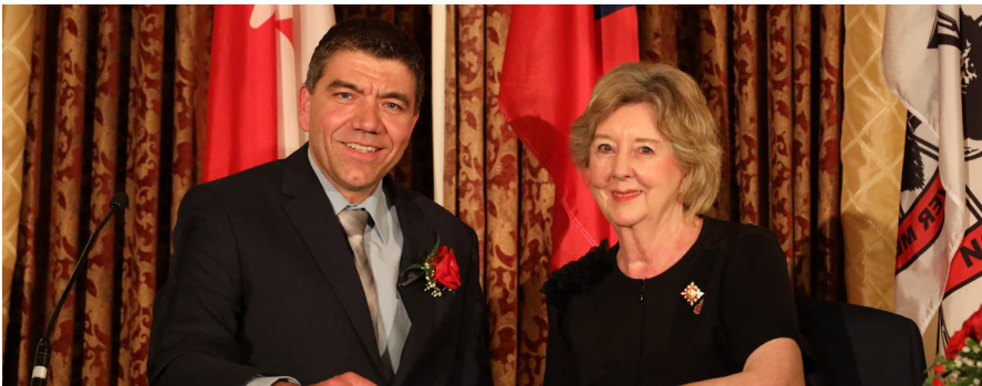
Associate Minister Fleming poses for a photo with The Honourable Janice C. Filmon during the oath of office ceremony.