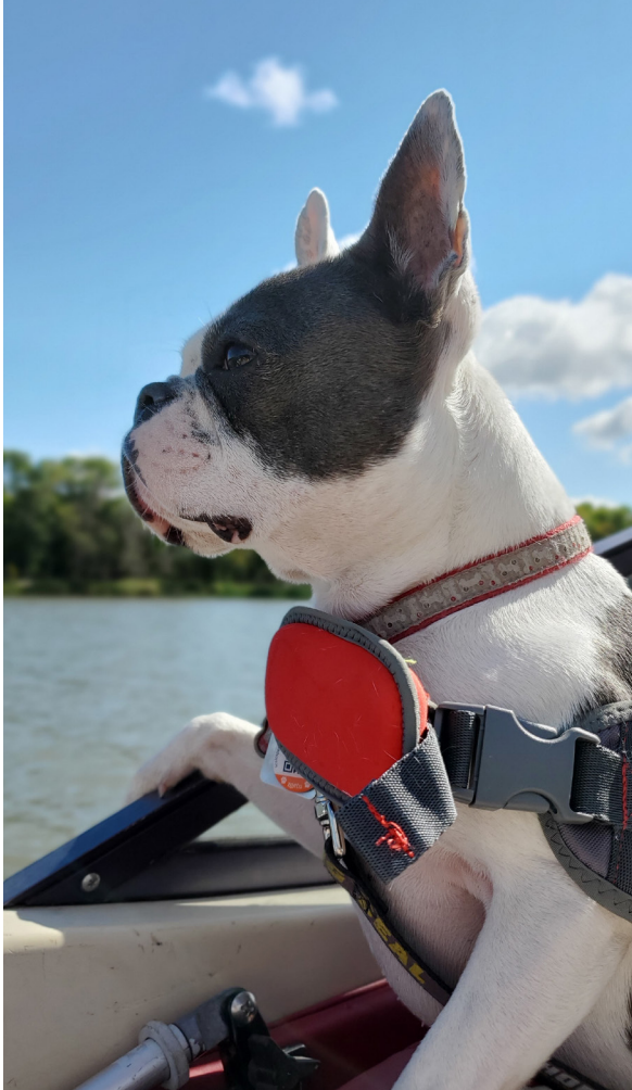
It’s oh-fish-al, Harvesting season is pawsitively awesome

Le Metis’ Community Photo section invites Métis Citizens to send in photos to be featured in our newsletter. If you have a photo that celebrates the Métis Nation, send it to communications@mmf.mb.ca and you may see it in print!