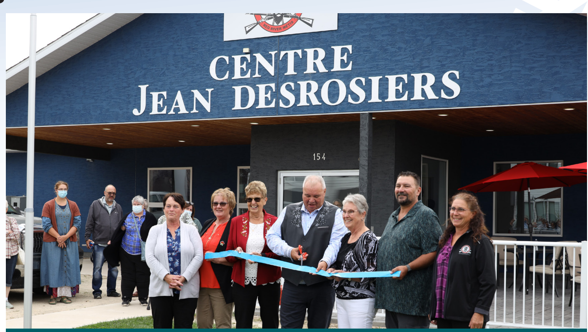
MMF Cabinet Members were on hand for the ribbon cutting at the Céntre Jean Desrosiers in September.

"We are using it for meetings and (to host) events that the people want, such as small weddings, socials, Christmas parties, showers, and wedding showers. It's also for the Little Métis Sing With Me program (for) mothers, grandmothers, and small children. It's being used for that already," she said.