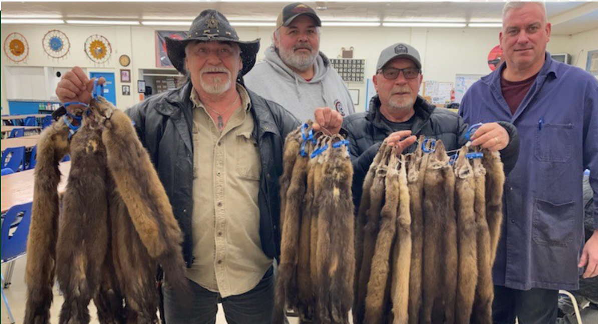
To sell furs to the RRMFC, you must be a Red River Métis Citizen and hold your provincial trapping licence in the same name as your MMF Citizenship Card.

The Red River Métis Fur Company is coming to a region near you to buy furs from Métis Harvesters.